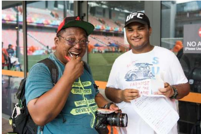
Our Ambassadors sharing the cause and getting people to join us on the register!

Match for Life 2020 is already on its way and we're looking forward to an even more exciting time. Let us know if you want to be a part of our planning committee!