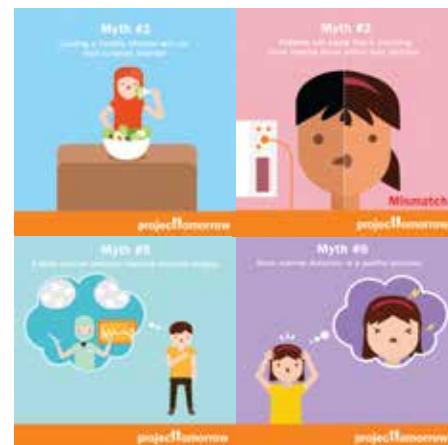
A series of gifs were made to debunk the myths and misconceptions that surrounded bone marrow donation in the second phase.