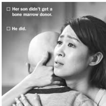
The first phase created awareness about bone marrow donation. The public were asked to make a choice – the right one being to be a bone marrow donor and choose to save a life.

Through Project Tomorrow and other recruitment efforts, 17,000 new donors signed up! With 2016’s target achieved, we are hyped up for 2017!